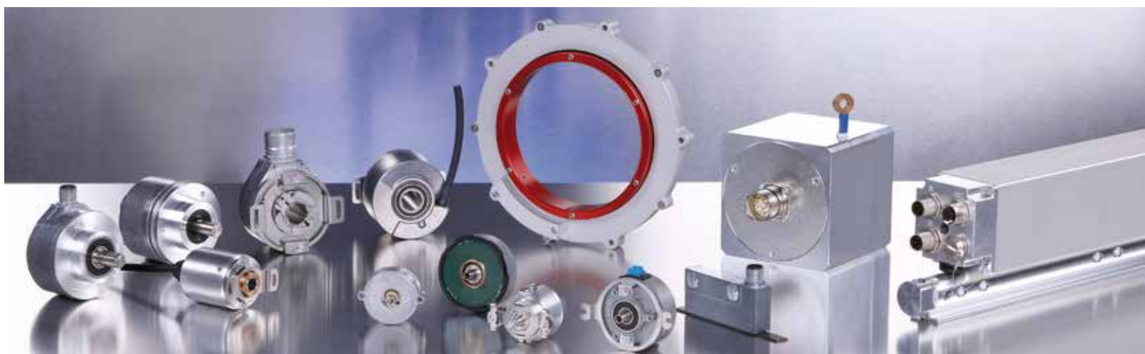
For more than five decades, the products of SICK STEGMANN GmbH have been making sure elevators arrive at the right floor, gantry cranes are positioned properly, and electric motors can operate at low energy.