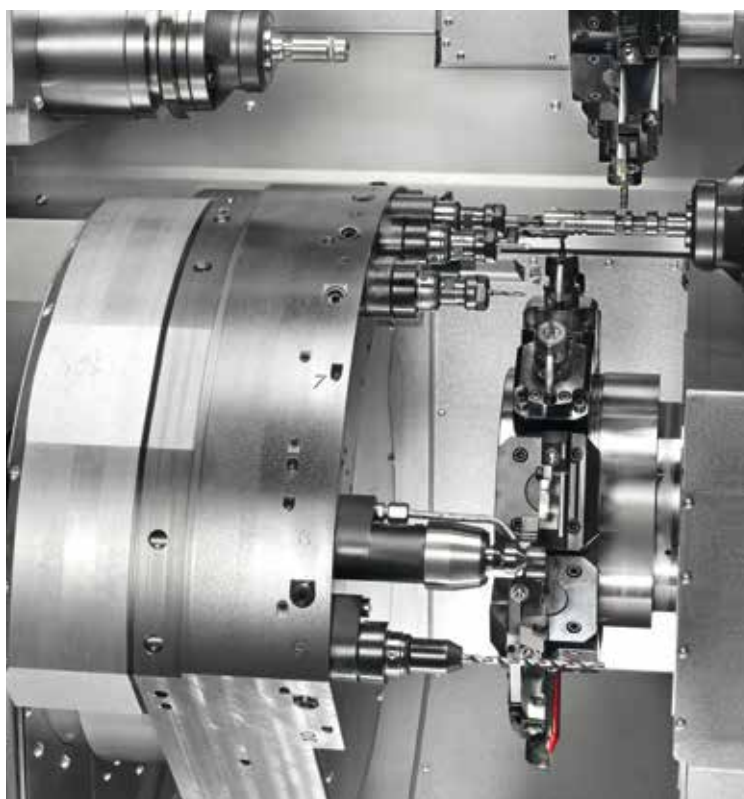
A signature feature of the TRAUB TNL32-11 is the front working attachment, equipped with 8 tool stations, 4 of which are live.