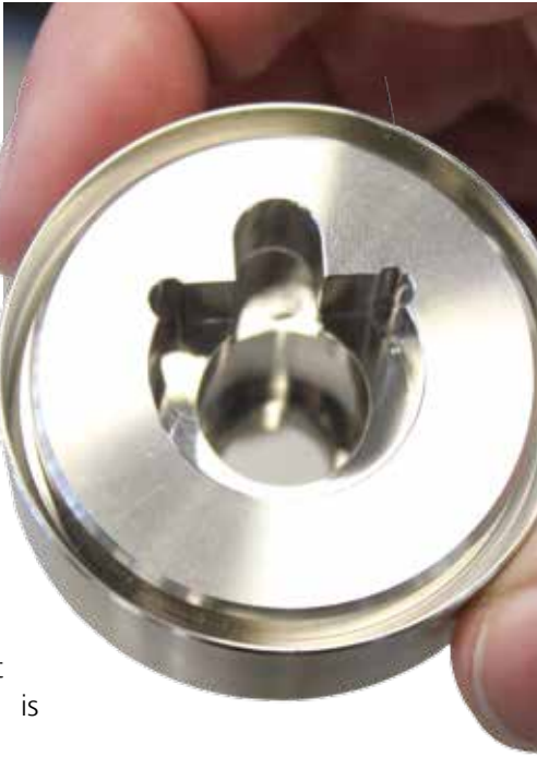
Top image: After the turning, live tools in the turrets start the milling so that parts come out of the machine completely finished.