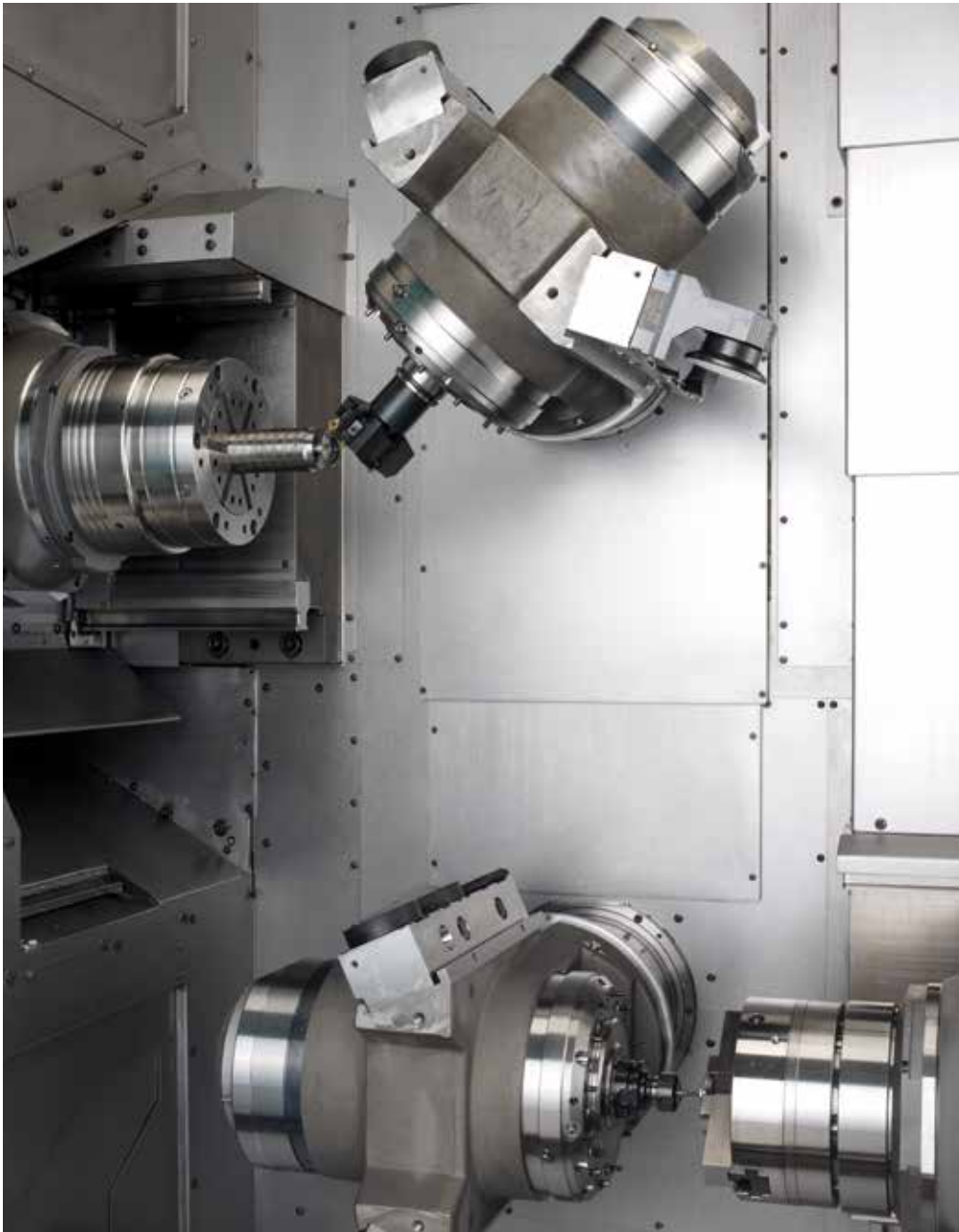
The INDEX R200 and R300 turn-mill centers have a main and counter spindle. There are two tool carriers in the work area that each have a motorized milling spindle. The axis configuration makes machining possible on both spindles in five axes.

Dr. Sellmeier explains: "With two separate cutter heads, we can improve cutter head mobility, which allows us to achieve an increase in cutting performance and more freedom for contact pattern correction."