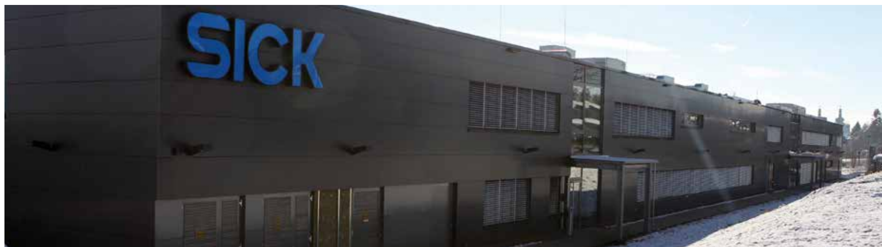
The new product building in Donaueschingen